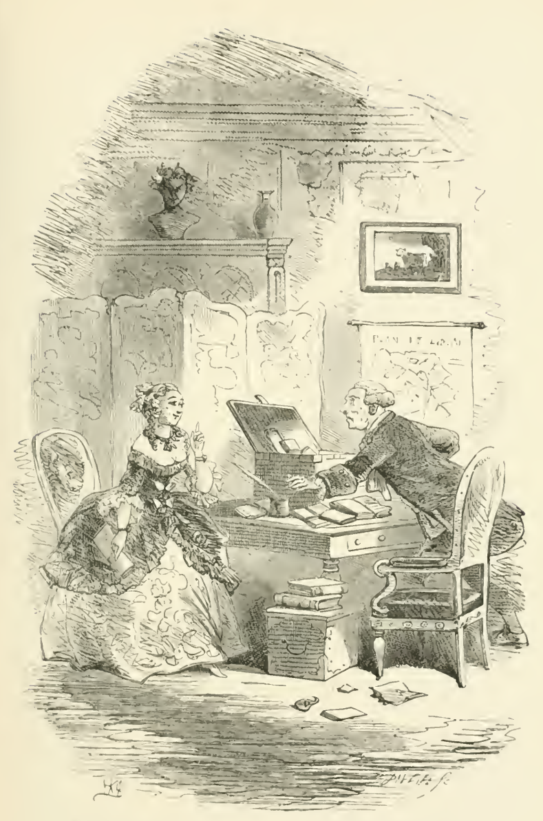
MRS. JENKYNS TAKING A PEEP INTO FAIRLIE'S STRONG BOX.